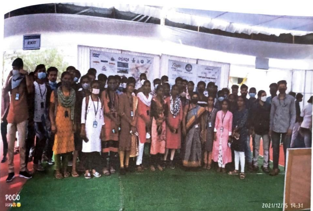
Field visit by Department of Physics to Hindustan Aeronautics Limited Hyderabad on 25.11.2021