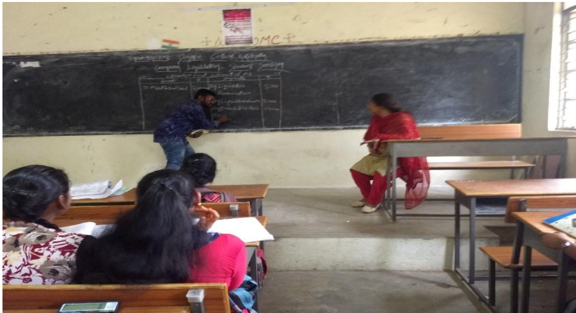
Student Seminar organised by Department of Commerce

The Department of Microbiology conducted an Essay writing competition and a Quiz competition. The details are given in below links.